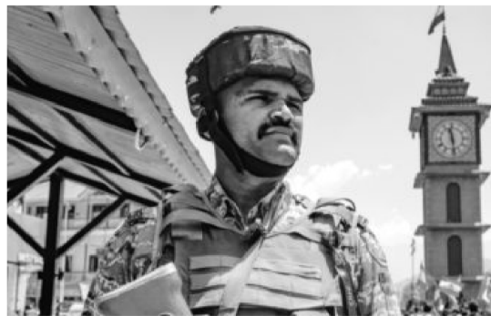
श्रीनगर स्थित लाल चौक पर मुस्तैद जवान

भारत और पाकिस्तान के बीच संघर्ष विराम के लिए 10 मई को बनी सहमति के बाद अब विश्वास बहाली के उपायों को जारी रखने का फैसला लिया गया है ताकि सतर्कता स्तर में कमी की जा सके। भारतीय अधिकारियों ने गुरुवार को यह जानकारी दी। यह स्पष्टीकरण तब आया जब पाकिस्तानी सेना ने कहा कि शत्रुता समाप्त करने पर बनी